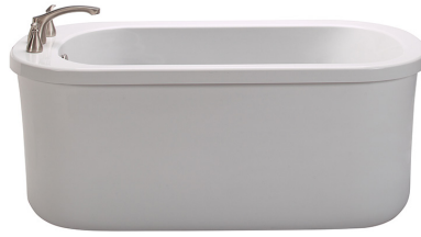
Shown with faucet installed (not supplied by MTI)

NOTE: Filling this tub to the maximum may require an above average size or dedicated water heater.