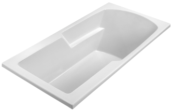
Shown with Whirlpool Package