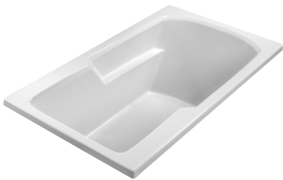
Shown with Whirlpool Package