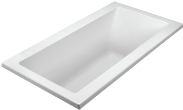
Shown with Whirlpool Package