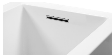
Optional Slim-Line overflow