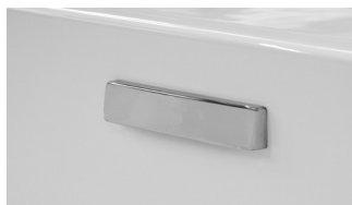
Rectangular overflow included