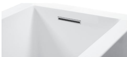
Optional Slim-Line overflow