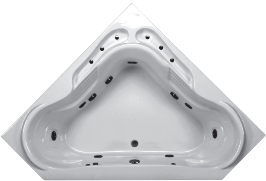
Shown with Standard Whirlpool package and optional Trim Kit.