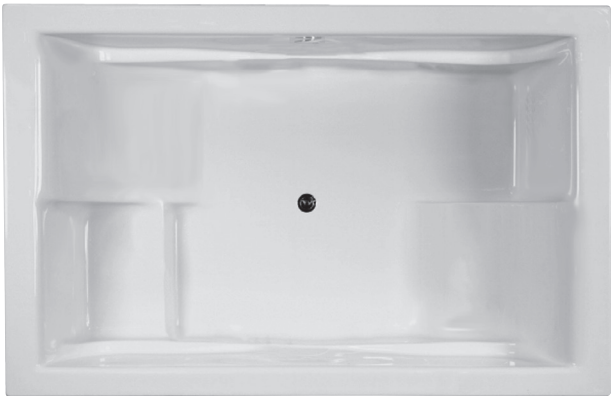
Features textured bottom.