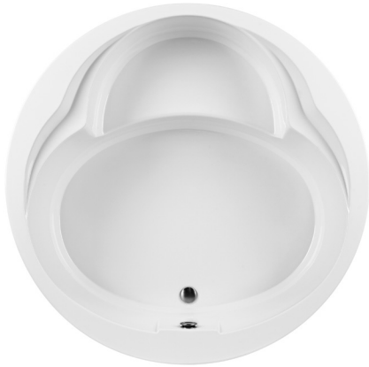
Features an integral seat.