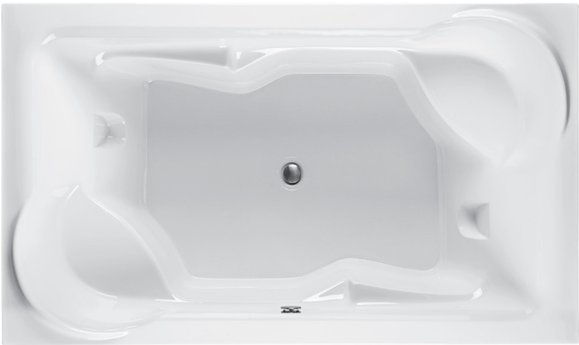
Features integral seats.

Compliance Label Model MTXXXX Made in USA Complies with ANSI Z124.1-1995 CSA Certified C/US