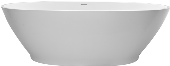
Features an integrated overflow.