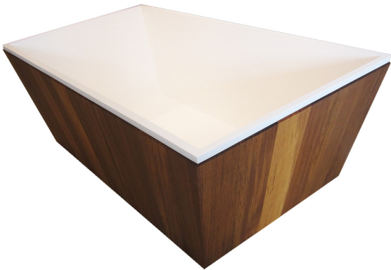
Features an integrated overflow and Teak Wrap.