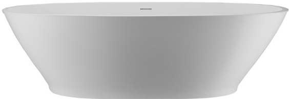
Features an integrated overflow.