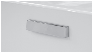
Rectangular overflow included