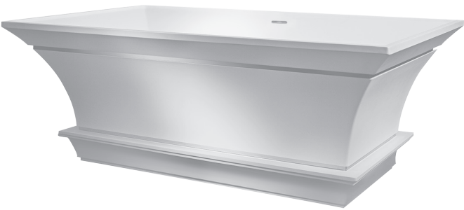
Features an integrated overflow. Shown above with optional routed channels.