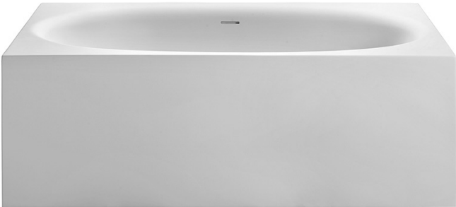
Features an integrated overflow.