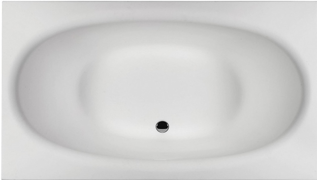
Features an integrated overflow.