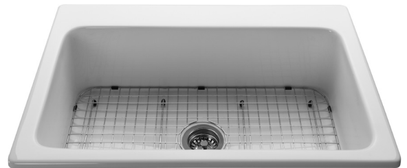
optional sink grid insert