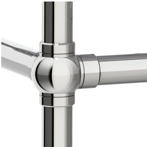
Close-up of Tradtional corner fitting.