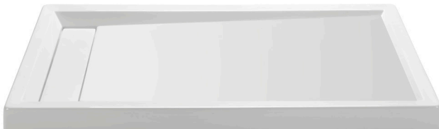
Color matched SculptureStone® hidden drain cover comes standard on white base.

Material - Acrylic Shipping Weight - 125 lbs / 57 kg Threshold - Multiple, Low-Profile Drain Location - End Flooring - Smooth