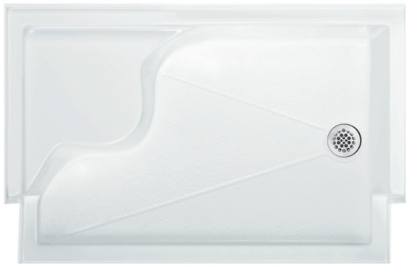
Shown above wiith right-hand drain.