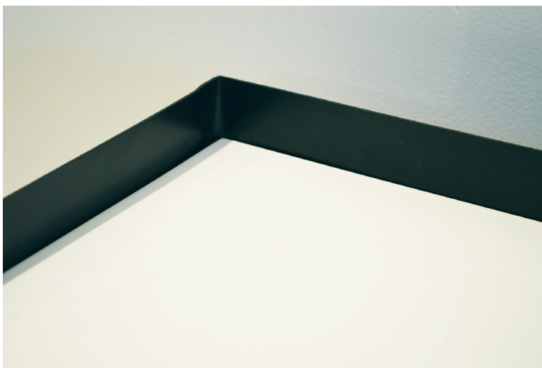
Factory installed Tile Flange is bonded to the the sides of the tub as specified at the time of order.

The Tile Flange option ensures watertight installation between the tub deck and the surrounding wall area. Specify factory-installed flange at the time of order, or as a field-installation kit to be applied onsite.