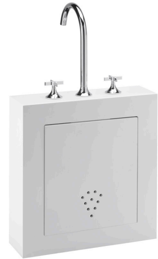
Rear view with vented access panel