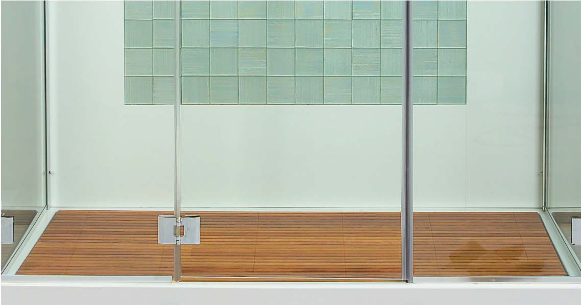
60"x30" custom teak shower tray shown above. Trays in excess of 70" will have slats that run opposite of those shown above.